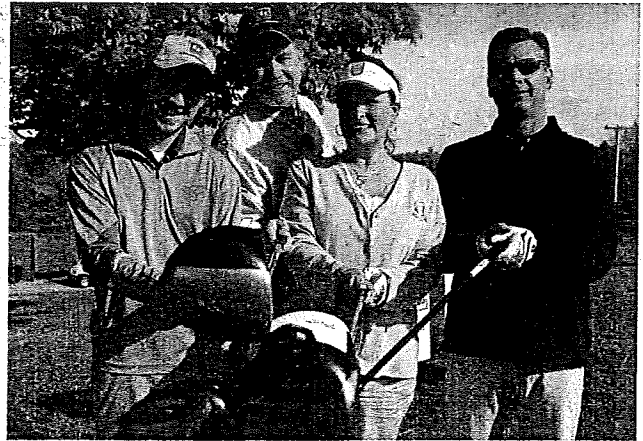
Representatives from Eaton Federal Savings Bank, prepare to tee off in last year's charity event.

The mission of Housing Services Mid Michigan is to assist low- to moderate-income individuals and families fulfill their need for affordable, safe, and sanitary housing through the participation in federal, state, and local programs and services. Through coordination of